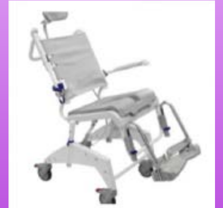
• Wheeled Commode