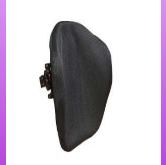
• Blake Medical Back