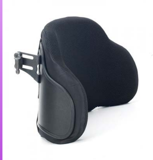
• Jay Back