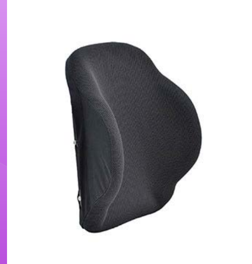
• Future Mobility Back