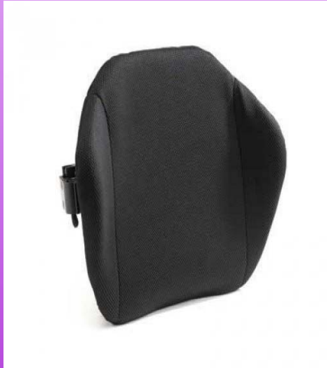
• Invacare Matrix